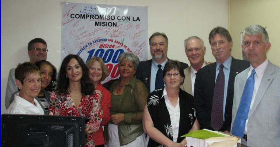
Above: Members of the Civitas International Delegation representing the Dominican Republic, Oklahoma, Colorado, and Michigan, March 2009 at the Dominican Republic

February 4-10, 2010 Oklahoma will host the first group of Dominican Republic Civitas Exchange Delegates.