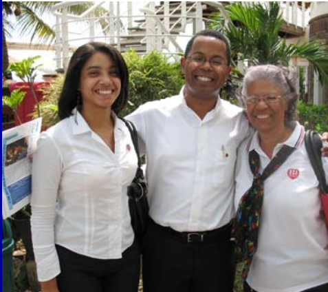
Above and right: Dominican Delegates and associates

February 4-10, 2010 Oklahoma will host the first group of Dominican Republic Civitas Exchange Delegates.